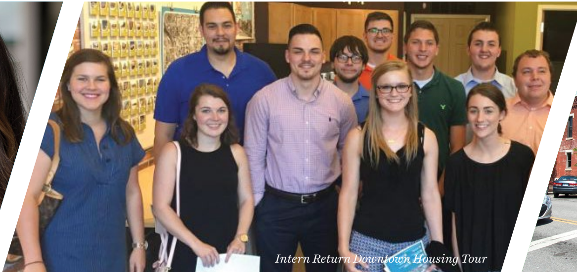
Intern Return Downtown Housing Tour