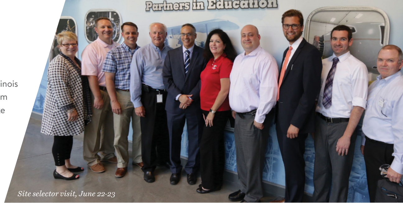
Site selector visit, June 22-23

A delegation of private businesses, local organizations and Greater Wichita Partnership staff visited four Chicago-based site selection firms in October. The business community provided personal insight into doing business locally and the Partnership team shared regional opportunities for business growth and development.