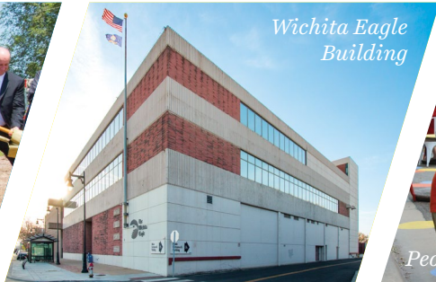
Wichita Eagle Building