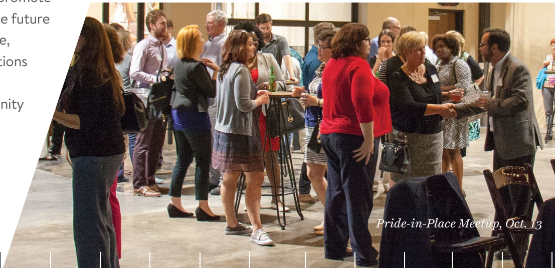
Pride-in-Place Meetup, Oct. 13