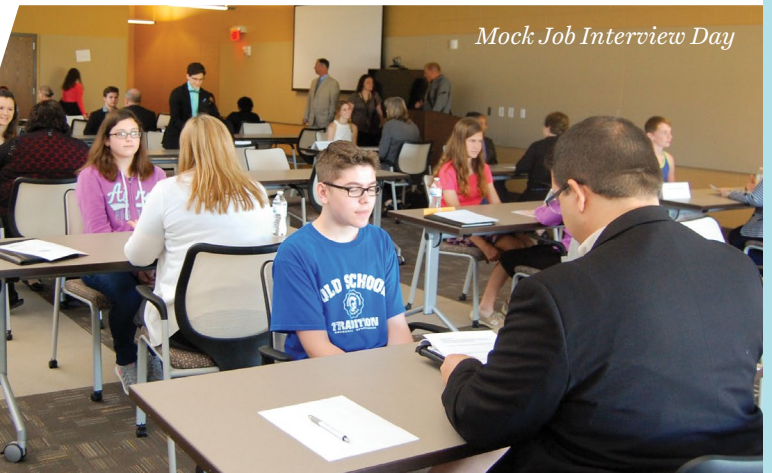
Mock Job Interview Day