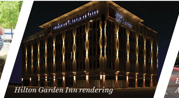
Hilton Garden Inn rendering