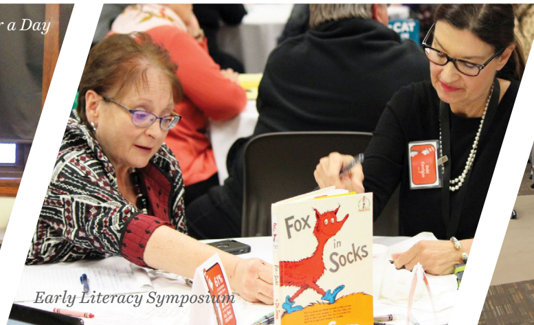
Early Literacy Symposium