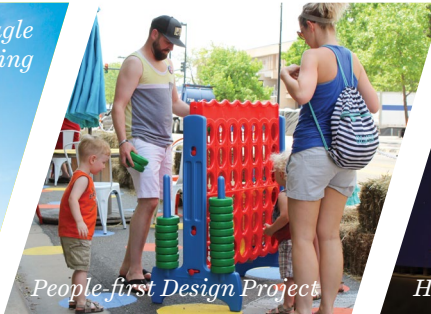
People-first Design Project