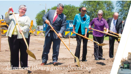
Advanced library groundbreaking