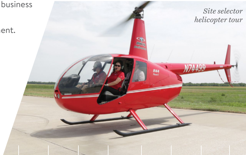
Site selector helicopter tour