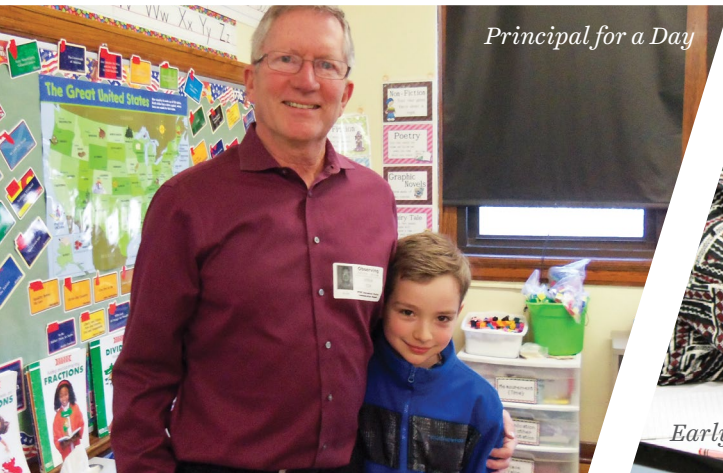
Principal for a Day

In April 2016, 124 students from four local school districts learned essential interview skills and participated in mock interviews with 52 business professionals. The response from the teachers and students was so positive that the BEA, in partnership with Workforce Alliance, plans on holding the event annually.