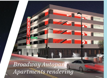
Broadway Autopark Apartments rendering