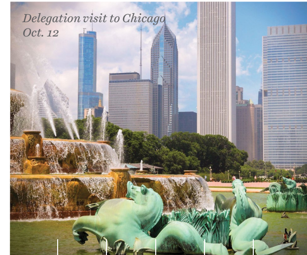
Delegation visit to Chicago Oct. 12