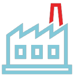
Advanced Manufacturing & Materials

Learn more about the Regional Growth Plan