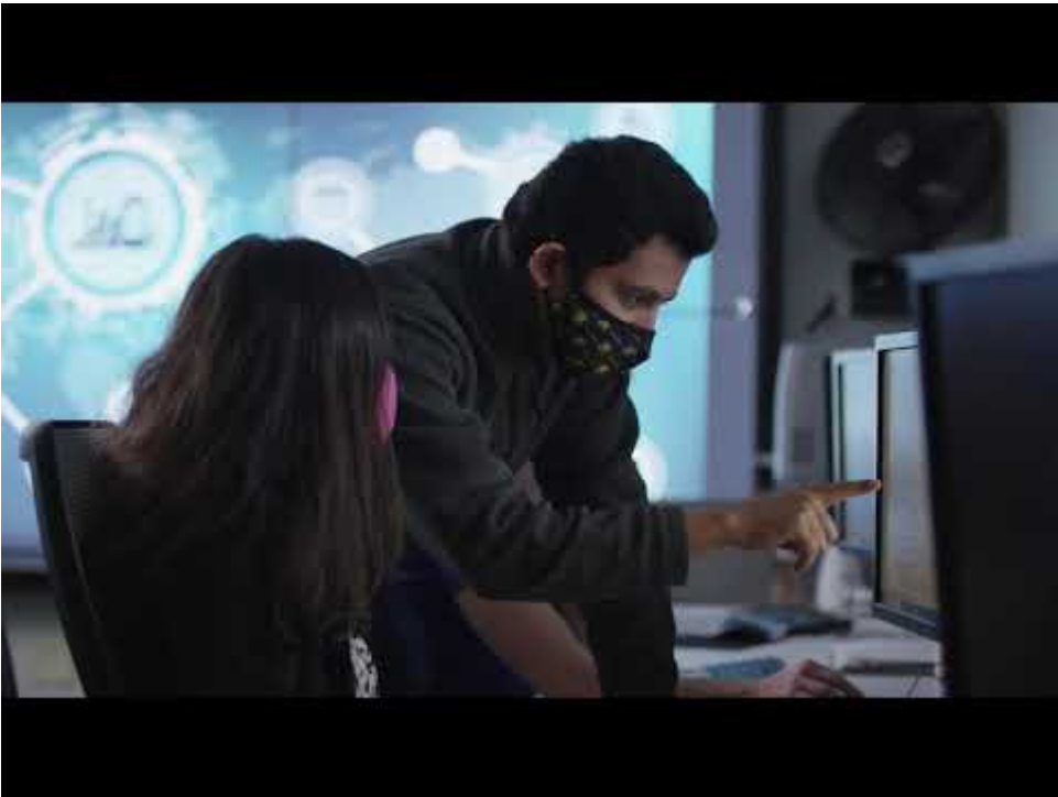
Greater Wichita Region Transportation and Logistics