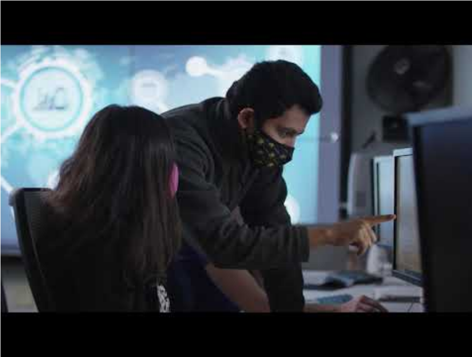
Greater Wichita Region Transportation and Logistics