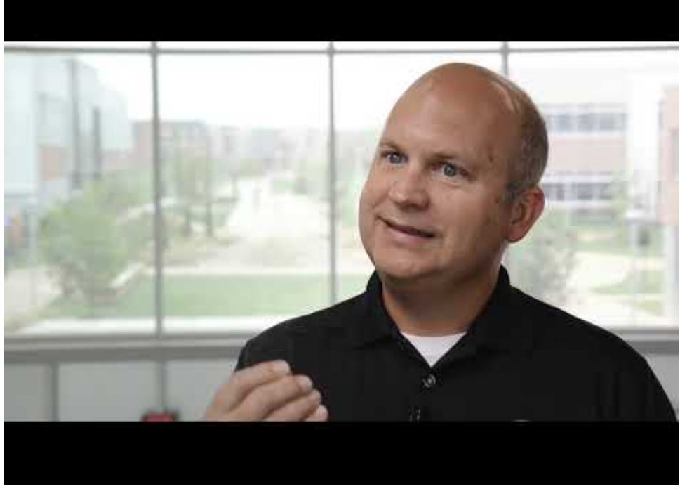
Wichita Aviation Talent Pipeline