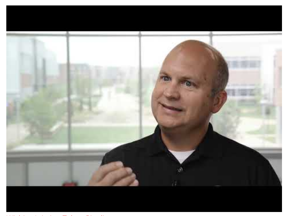
Wichita Aviation Talent Pipeline