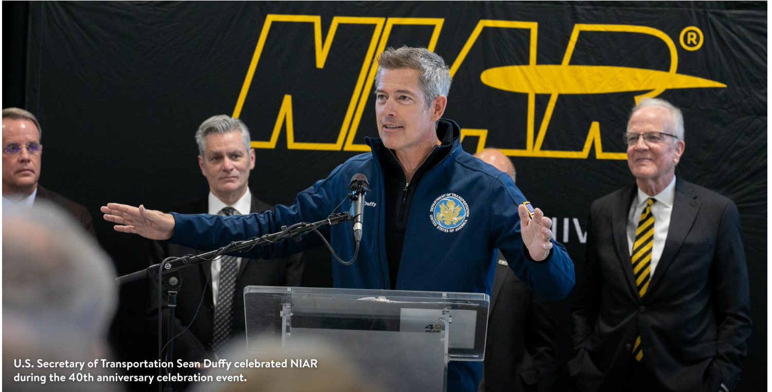
U.S. Secretary of Transportation Sean Duffy celebrated NIAR during the 40th anniversary celebration event.