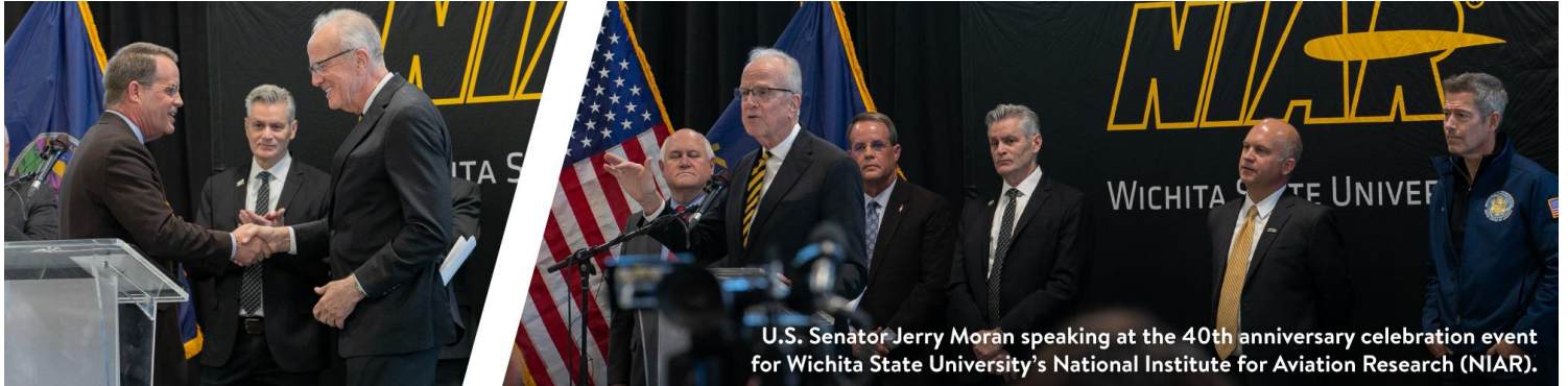
U.S. Senator Jerry Moran speaking at the 40th anniversary celebration event for Wichita State University's National Institute for Aviation Research (NIAR).