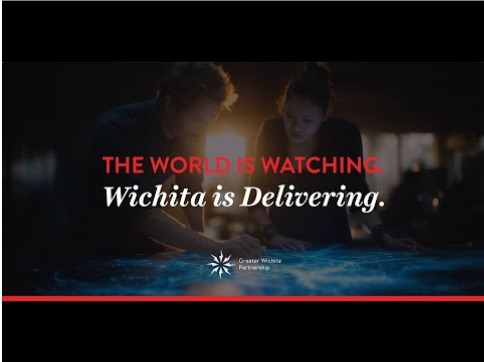
The World is Watching. Wichita is Delivering.