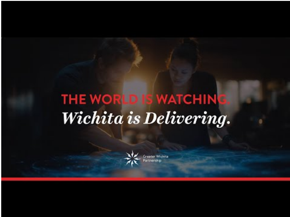
The World is Watching. Wichita is Delivering.