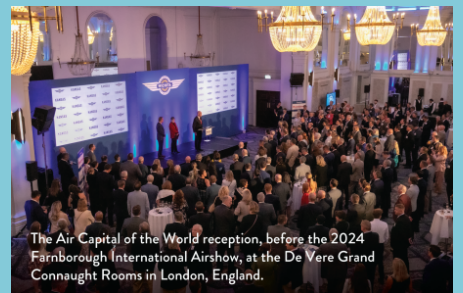
The Air Capital of the World reception, before the 2024 Farnborough International Airshow, at the De Vere Grand Connaught Rooms in London, England.