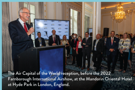
The Air Capital of the World reception, before the 2022 Farnborough International Airshow, at the Mandarin Oriental Hotel at Hyde Park in London, England.