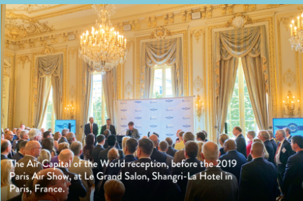
The Air Capital of the World reception, before the 2019 Paris Air Show, at Le Grand Salon, Shangri-La Hotel in Paris, France.