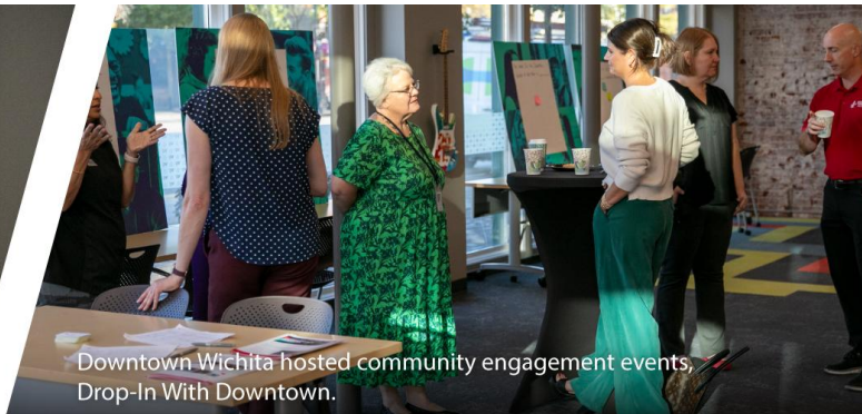
Downtown Wichita hosted community engagement events, Drop-In With Downtown.