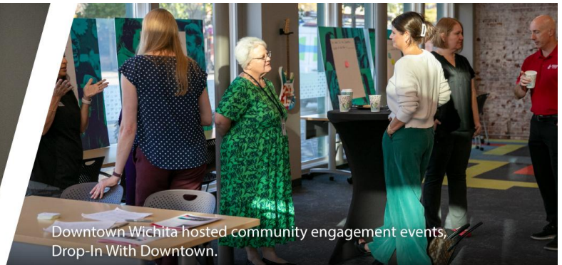
Downtown Wichita hosted community engagement events, Drop-In With Downtown.