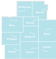
A View of a Vibrant Region