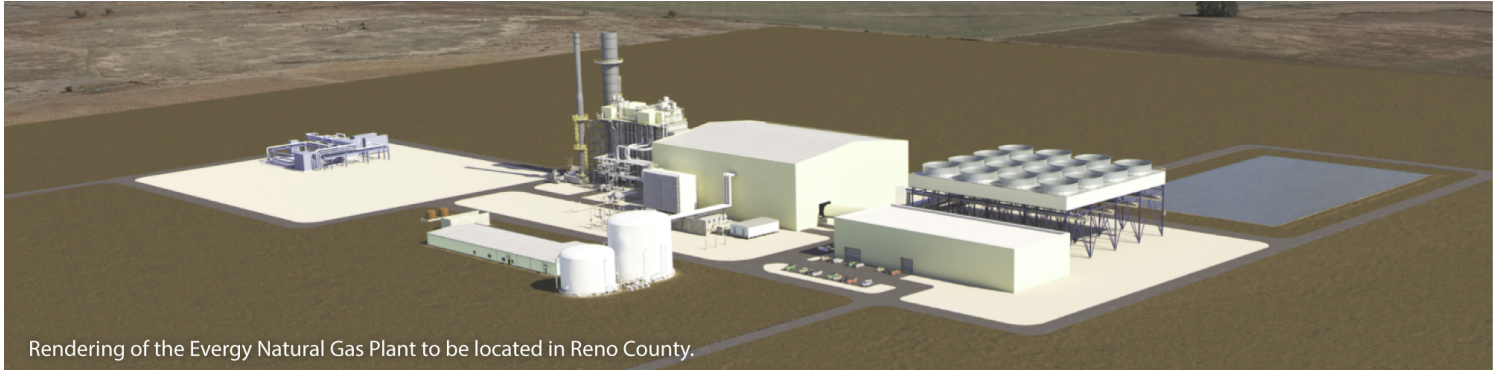
Rendering of the Evergy Natural Gas Plant to be located in Reno County.