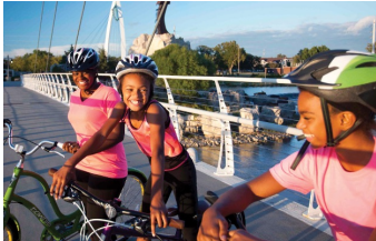
Data Insight: Points of Pride