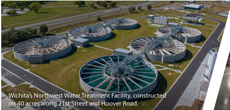
Wichita's Northwest Water Treatment Facility, constructed on 40 acres along 21st Street and Hoover Road.

The Wichita region is making significant strides to strengthen its infrastructure with several major projects, including the City of Wichita's Northwest Water Treatment Facility, Evergy's investment in two new natural gas plants and the Kansas Department of Transportation's North Junction. In conjunction with numerous other infrastructure investments, these large-scale projects represent commitments to the region's long-term growth, sustainability and economic vitality.