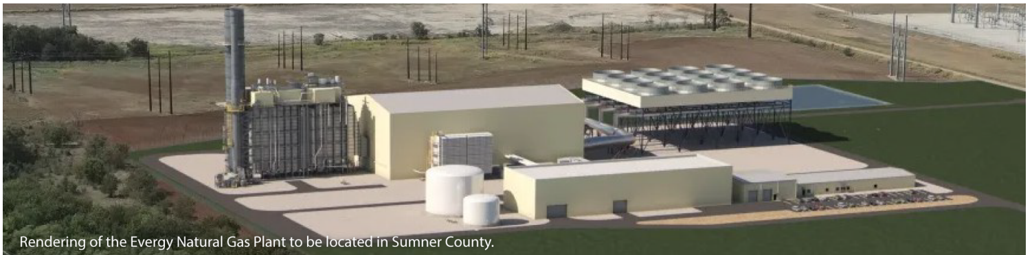
Rendering of the Evergy Natural Gas Plant to be located in Sumner County.

Located in Reno and Sumner counties, each plant is expected to create more than 500 construction jobs and 20-40 full-time, skilled-craft positions once operational. After a 10-year tax exemption, the plants are projected to generate more than $500 million in property tax revenue.