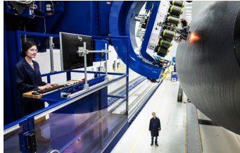
10 Keys to Greater Wichita Success