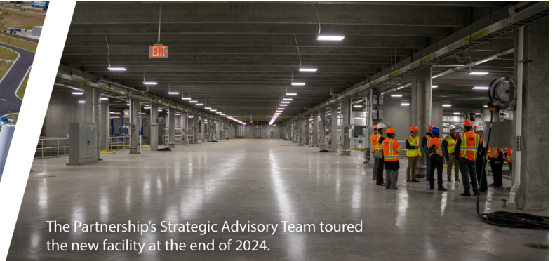
The Partnership's Strategic Advisory Team toured the new facility at the end of 2024.