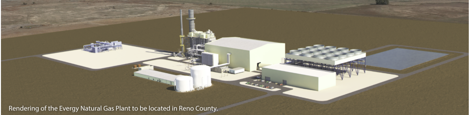
Rendering of the Evergy Natural Gas Plant to be located in Reno County.