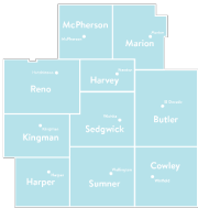
A View of a Vibrant Region