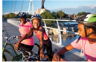
Data Insight: Points of Pride