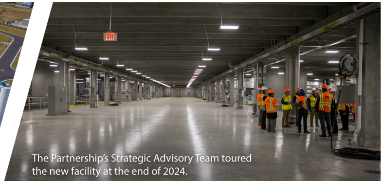
The Partnership's Strategic Advisory Team toured the new facility at the end of 2024.