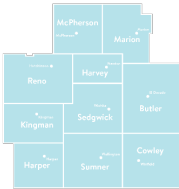
A View of a Vibrant Region