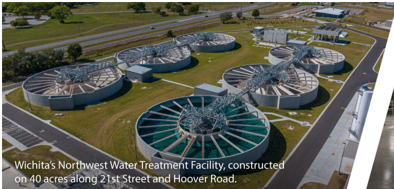
Wichita's Northwest Water Treatment Facility, constructed on 40 acres along 21st Street and Hoover Road.

The Wichita region is making significant strides to strengthen its infrastructure with several major projects, including the City of Wichita's Northwest Water Treatment Facility, Evergy's investment in two new natural gas plants and the Kansas Department of Transportation's North Junction. In conjunction with numerous other infrastructure investments, these large-scale projects represent commitments to the region's long-term growth, sustainability and economic vitality.