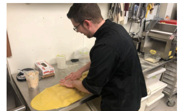
Bridging the Gap: Teacher Externships Help Shape the Workforce of Tomorrow