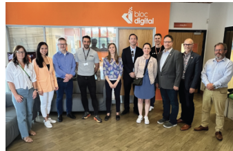
Bloc Digital Inc. Expands to Wichita, Bringing Cutting-Edge Technologies to the Midwest