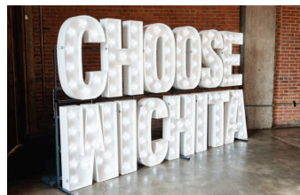
Choose Wichita Event Even More Popular Than Expected