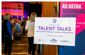
Talent Talk Showcases Future Career Opportunities