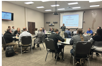
Learn more about our Strategic Advisory Team.