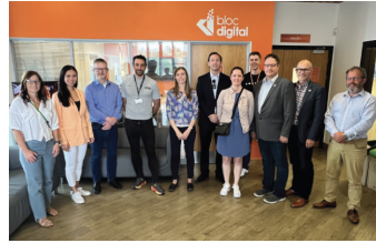
Bloc Digital Inc. Expands to Wichita, Bringing Cutting-Edge Technologies to the Midwest