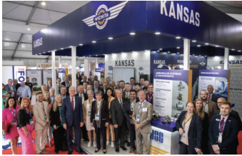
Farnborough 2024 Highlights Wichita Region's Dominance in Aerospace, Defense