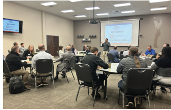
Learn more about our Strategic Advisory Team.