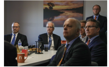
Novacoast Announces New Headquarters in Wichita, Kansas