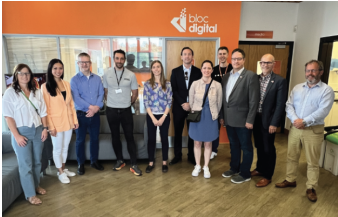
Bloc Digital Inc. Expands to Wichita, Bringing Cutting-Edge Technologies to the Midwest