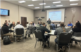
Learn more about our Strategic Advisory Team.