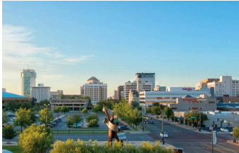
Wichita’s Biomedical Campus: An Investment in Wichita’s Future