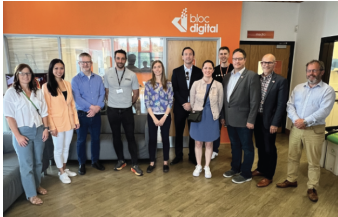
Bloc Digital Inc. Expands to Wichita, Bringing Cutting-Edge Technologies to the Midwest