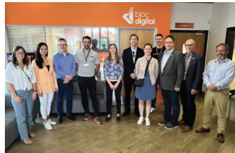
Bloc Digital Inc. Expands to Wichita, Bringing Cutting-Edge Technologies to the Midwest