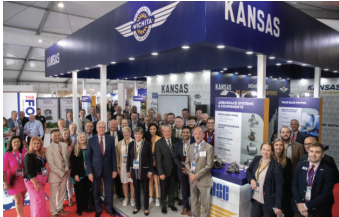
Farnborough 2024 Highlights Wichita Region's Dominance in Aerospace, Defense