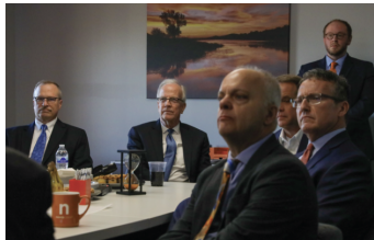
Novacoast Announces New Headquarters in Wichita, Kansas