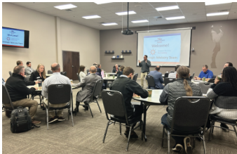
Learn more about our Strategic Advisory Team.