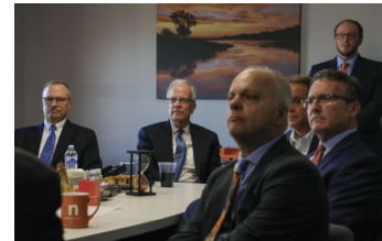
Novacoast Announces New Headquarters in Wichita, Kansas