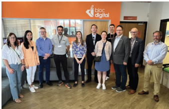
Bloc Digital Inc. Expands to Wichita, Bringing Cutting-Edge Technologies to the Midwest