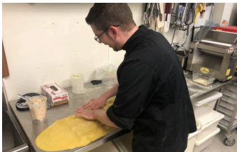
Bridging the Gap: Teacher Externships Help Shape the Workforce of Tomorrow