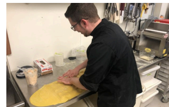
Bridging the Gap: Teacher Externships Help Shape the Workforce of Tomorrow