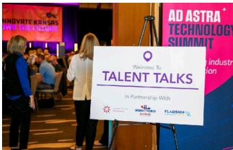
Talent Talk Showcases Future Career Opportunities