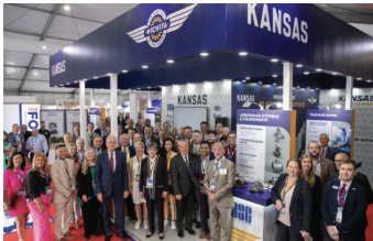
Farnborough 2024 Highlights Wichita Region's Dominance in Aerospace, Defense