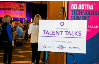
Talent Talk Showcases Future Career Opportunities