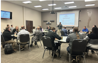
Learn more about our Strategic Advisory Team.