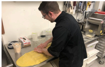
Bridging the Gap: Teacher Externships Help Shape the Workforce of Tomorrow