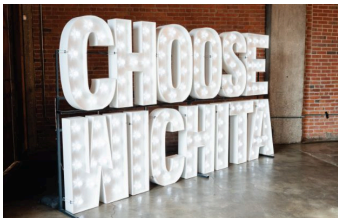
Choose Wichita Event Even More Popular Than Expected