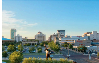
Wichita's Biomedical Campus: An Investment in Wichita's Future