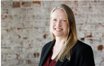
Enhancing Wichita’s Quality of Place: A New Perspective

The Partnership’s strategic priority of quality of life ensures Wichita remains affordable, safe and welcoming. By championing beautification efforts in the core and transformational projects like the Wichita Biomedical Campus and EP2 Initiative, the Partnership helps make Wichita increasingly competitive and attractive to talent from around the globe.