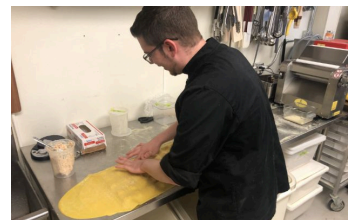
Bridging the Gap: Teacher Externships Help Shape the Workforce of Tomorrow