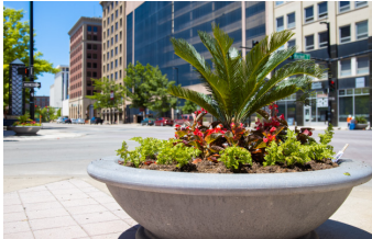
Transforming Downtown Wichita into a Vibrant Urban Environment