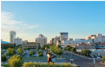
Wichita’s Biomedical Campus: An Investment in Wichita’s Future