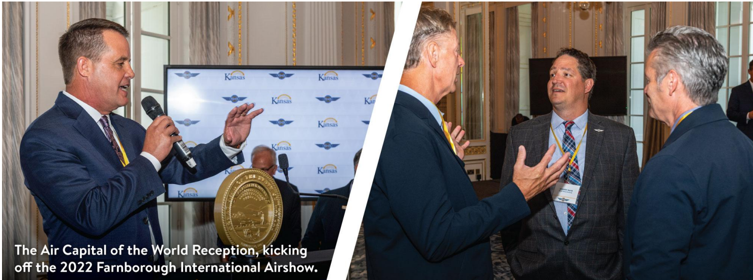
The Air Capital of the World Reception, kicking off the 2022 Farnborough International Airshow.