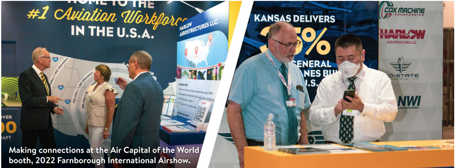
Making connections at the Air Capital of the World booth, 2022 Farnborough International Airshow.

With nearly 18% of regional jobs in manufacturing, Wichita ranks as the No. 1 manufacturing metro in the United States. In addition, the region boasts more than 450 world-class suppliers making it a highly coveted and globally renowned, pro-aviation city.