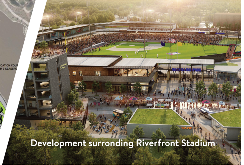
Development surrounding Riverfront Stadium