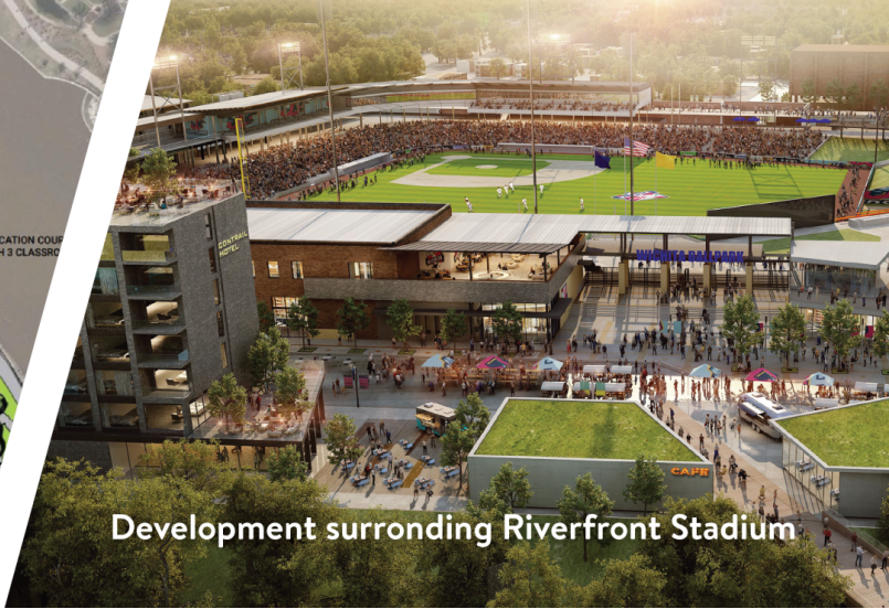
Development surrounding Riverfront Stadium