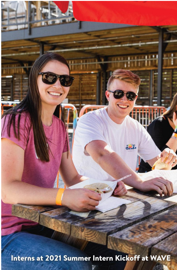
Interns at 2021 Summer Intern Kickoff at WAVE