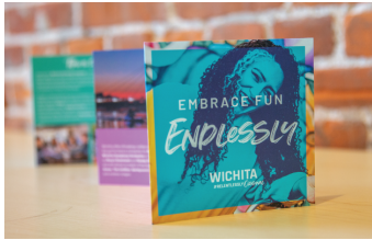
A PERFECT DAY IN WICHITA