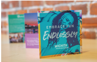
A PERFECT DAY IN WICHITA