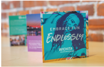
A PERFECT DAY IN WICHITA