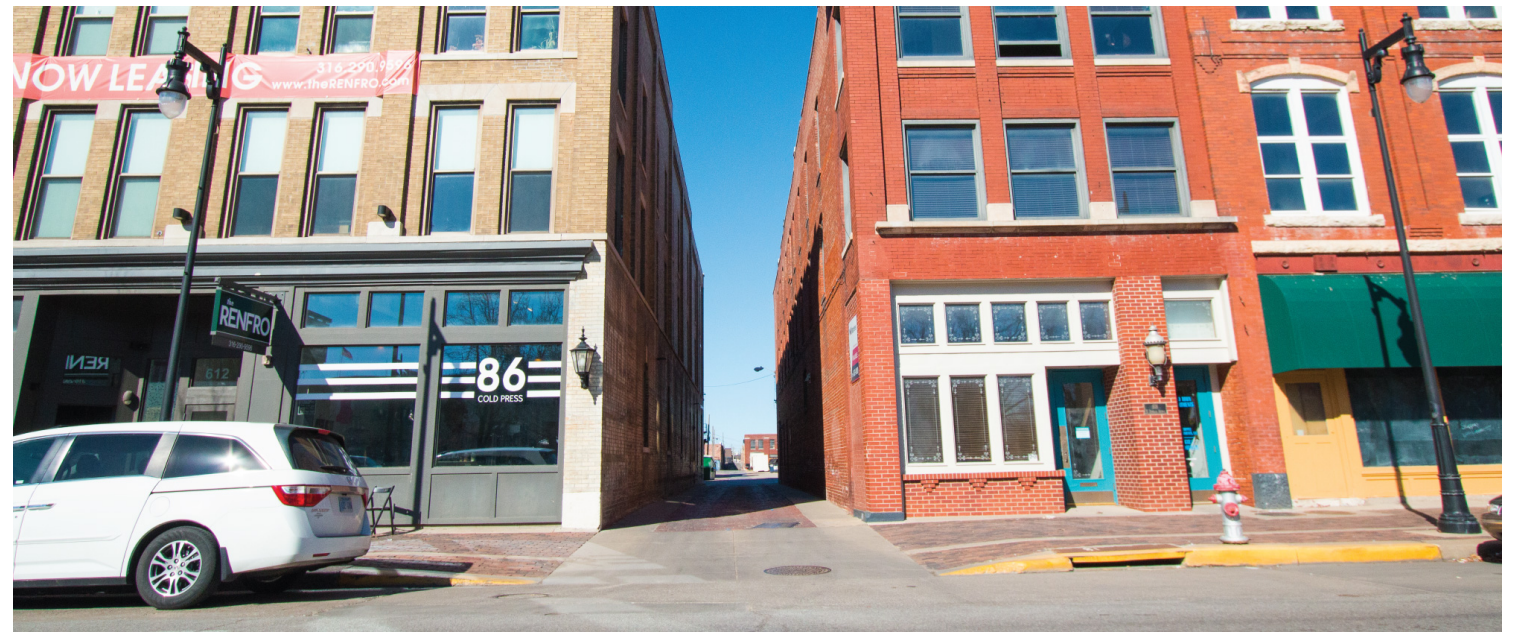
Gallery Alley before activation

The 2017 pilot project closed the alley to vehicular traffic, added overhead lighting, public art and seating options. The pilot proved to be an instant success as the residents and surrounding businesses quickly began regularly using the space to gather, experience art, have a coffee and meet with friends.