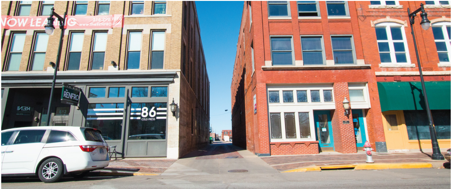
Gallery Alley before activation

The 2017 pilot project closed the alley to vehicular traffic, added overhead lighting, public art and seating options. The pilot proved to be an instant success as the residents and surrounding businesses quickly began regularly using the space to gather, experience art, have a coffee and meet with friends.