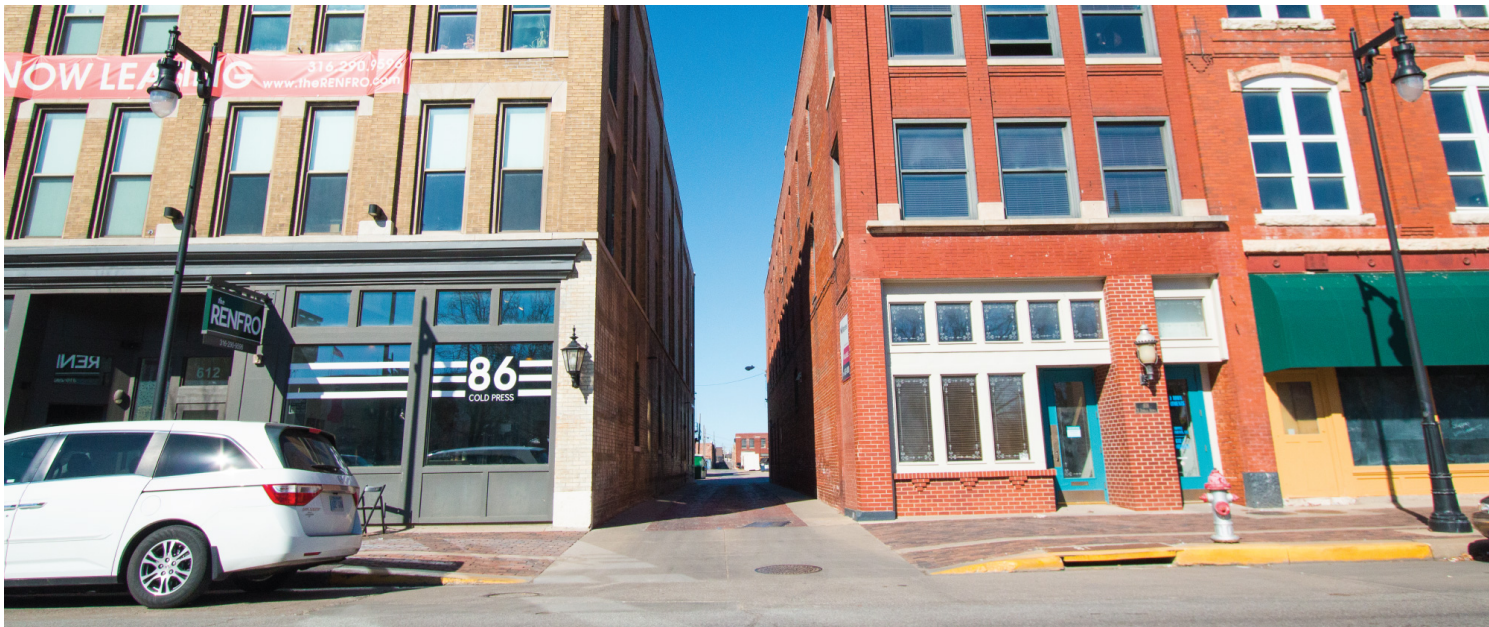
Gallery Alley before activation

The 2017 pilot project closed the alley to vehicular traffic, added overhead lighting, public art and seating options. The pilot proved to be an instant success as the residents and surrounding businesses quickly began regularly using the space to gather, experience art, have a coffee and meet with friends.