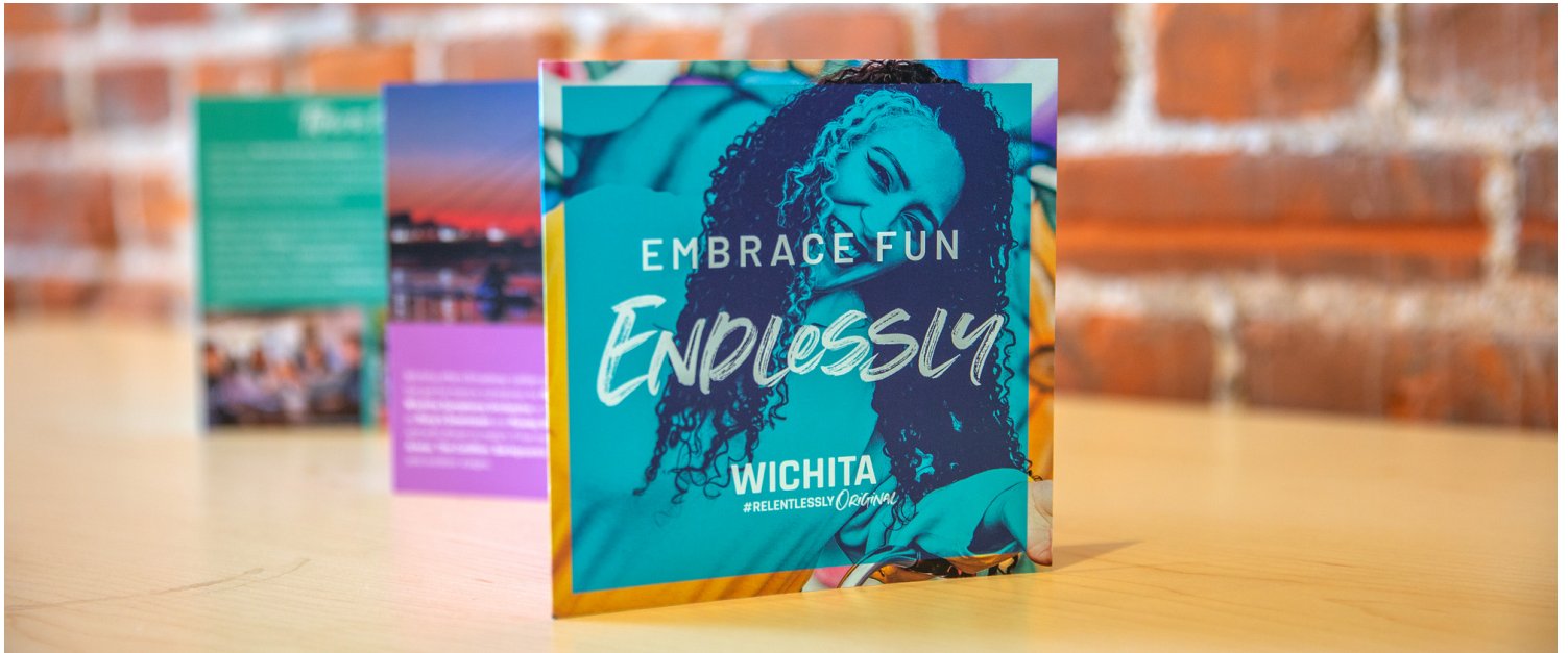
A Perfect Day in Wichita – one of the Choose Wichita talent attraction marketing pieces.

The Greater Wichita Partnership is ready to assist you in providing the resources needed to attract and develop talent in the region.