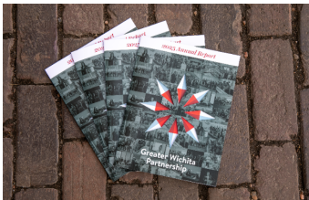
2025 Partnership Annual Report

To request printed copies of the report, please call 316.500.6650 or email info@greaterwichitapartnership.org .