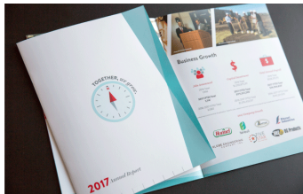
2017 Partnership Annual Report