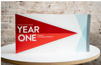
2016 Partnership Annual Report