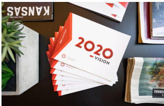
2020 Partnership Annual Report