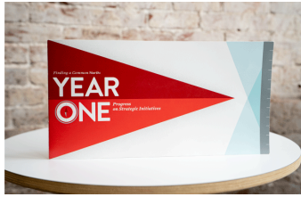
2016 Partnership Annual Report