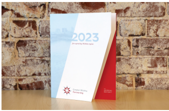
2023 Partnership Annual Report