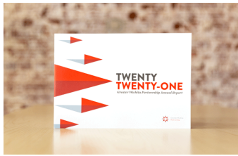
2021 Partnership Annual Report