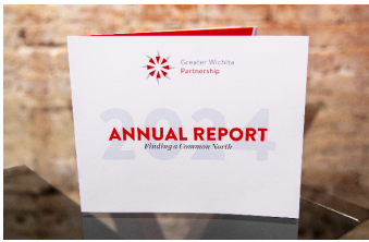
2024 Partnership Annual Report

To request printed copies of the report, please call 316.500.6650 or email info@greaterwichitapartnership.org .