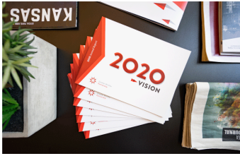
2020 Partnership Annual Report