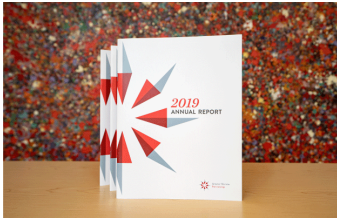
2019 Partnership Annual Report