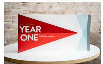
2016 Partnership Annual Report