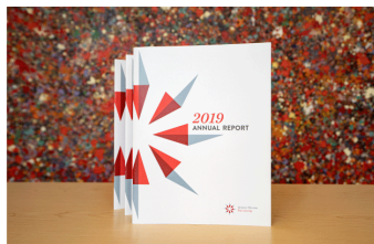
2019 Partnership Annual Report