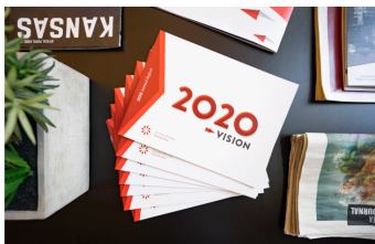
2020 Partnership Annual Report