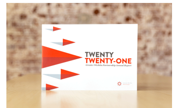
2021 Partnership Annual Report