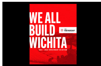
2022 Partnership Annual Report