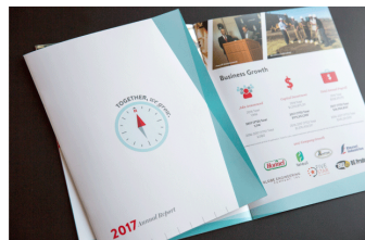
2017 Partnership Annual Report