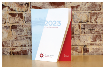
2023 Partnership Annual Report