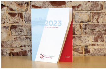
2023 Partnership Annual Report

To request printed copies of the report, please call 316.500.6650 or email info@greaterwichitapartnership.org .