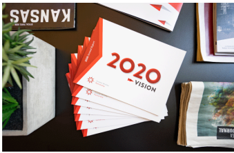
2020 Partnership Annual Report