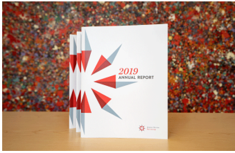
2019 Partnership Annual Report