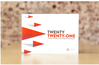
2021 Partnership Annual Report