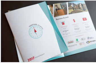
2017 Partnership Annual Report