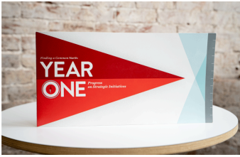
2016 Partnership Annual Report