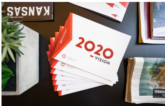
2020 Partnership Annual Report