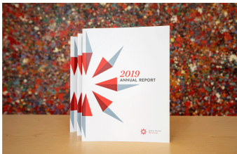
2019 Partnership Annual Report