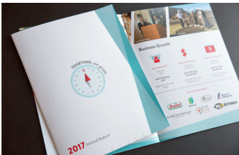
2017 Partnership Annual Report