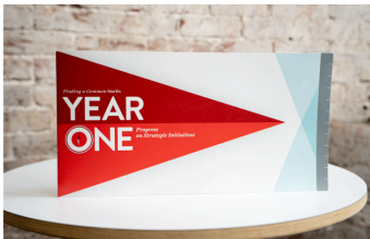
2016 Partnership Annual Report