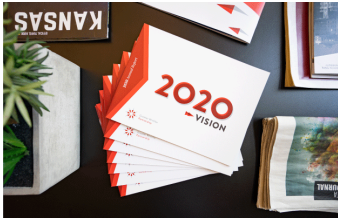
2020 Partnership Annual Report