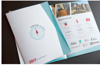
2017 Partnership Annual Report