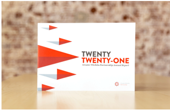
2021 Partnership Annual Report