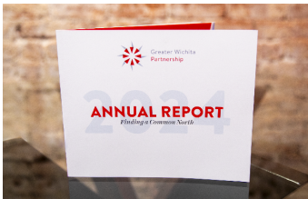
2024 Partnership Annual Report

To request printed copies of the report, please call 316.500.6650 or email info@greaterwichitapartnership.org .