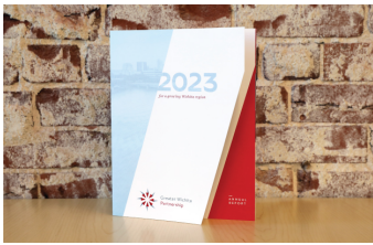
2023 Partnership Annual Report