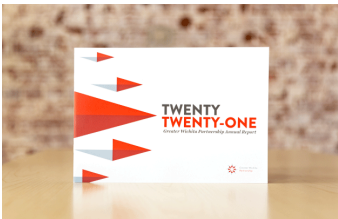
2021 Partnership Annual Report