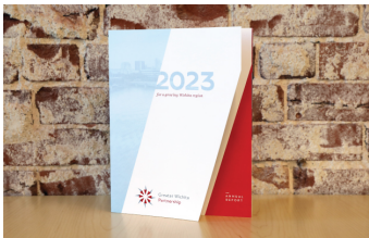
2023 Partnership Annual Report

To request printed copies of the report, please call 316.500.6650 or email info@greaterwichitapartnership.org .