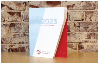
2023 Partnership Annual Report