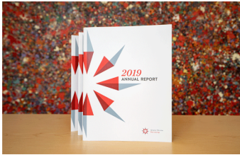
2019 Partnership Annual Report