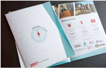
2017 Partnership Annual Report