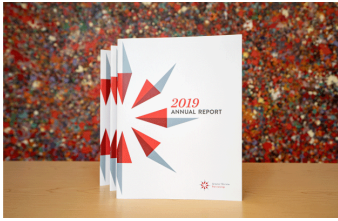
2019 Partnership Annual Report