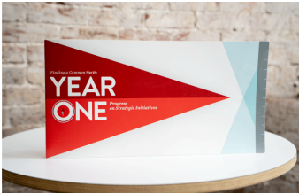
2016 Partnership Annual Report