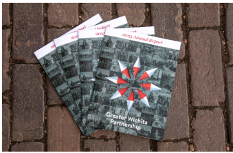
2025 Partnership Annual Report

To request printed copies of the report, please call 316.500.6650 or email info@greaterwichitapartnership.org .