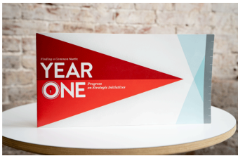
2016 Partnership Annual Report