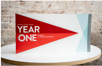
2016 Partnership Annual Report