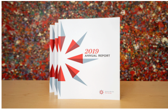
2019 Partnership Annual Report