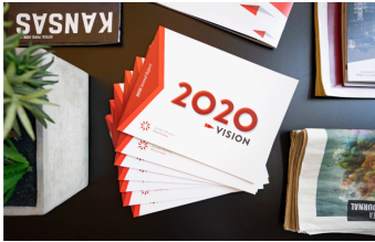
2020 Partnership Annual Report