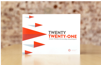
2021 Partnership Annual Report