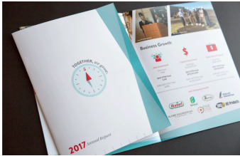
2017 Partnership Annual Report